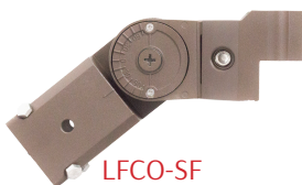
LFCO-SF Adjustable Slip Fitter for Pole Mount 2"–2-1/2"